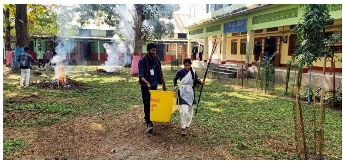
Plantation and cleanliness drive by NSS cadets